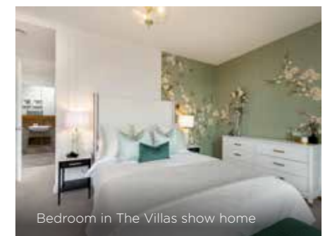
Bedroom in The Villas show home