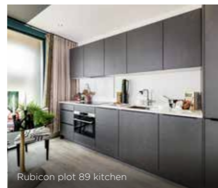
Rubicon plot 89 kitchen

Plot 89 showcases our stylish studio apartment. You may be surprised by the smart layout, which creates space to entertain or relax. The large bedroom area is cleverly separated from the living space, creating a private sanctuary while maintaining the flow of its flexible layout.