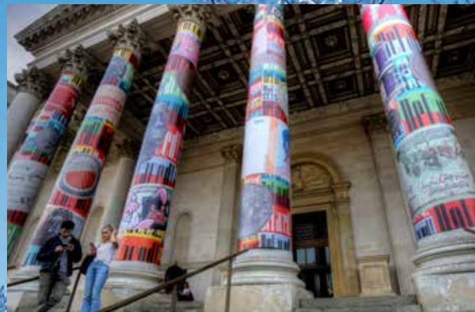
Defaced! Money, Conflict, Protest 11th October 2022 - 8th January 2023

The Fitzwilliam Museum, Trumpington Street, Cambridge CB2 1RB