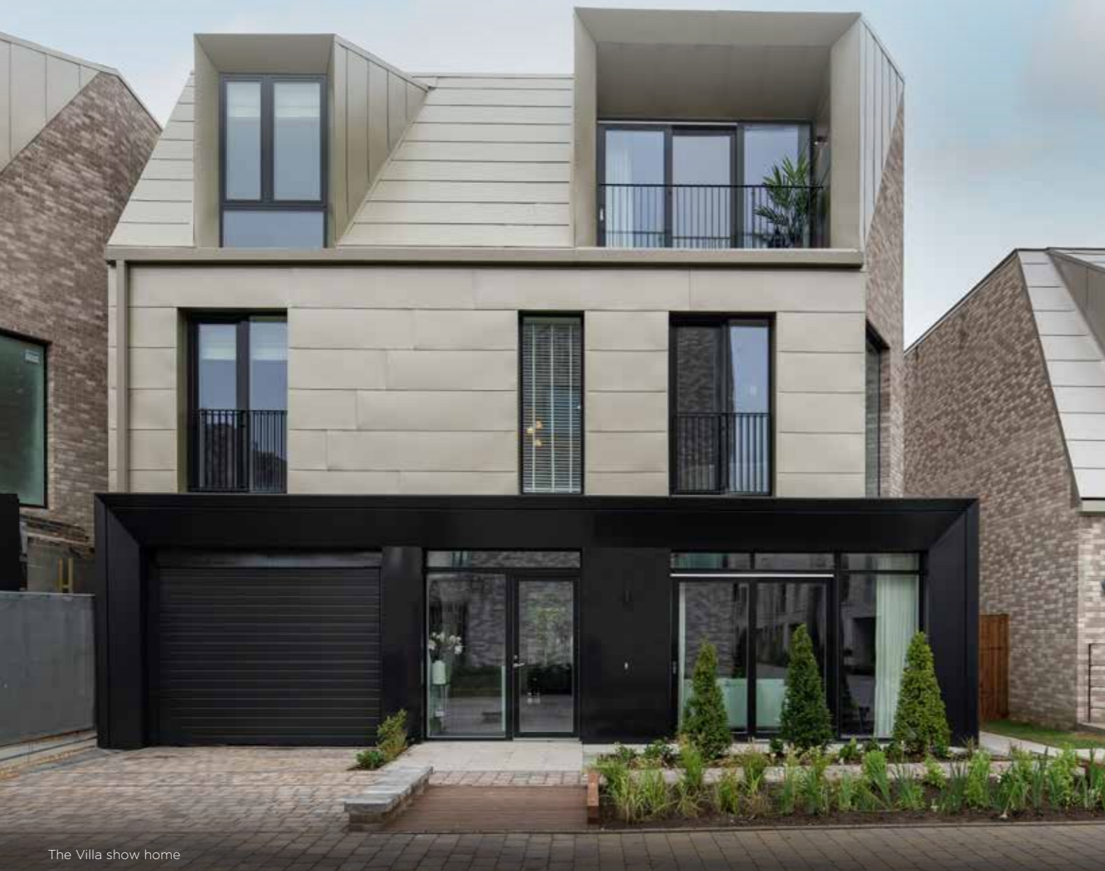
The Villa show home

Not only did The Cavendish – part of our prestigious Villas collection – win Best Family Home, it was also highly commended as the best home outside of London. Knights Park itself was highly commended for eco living.