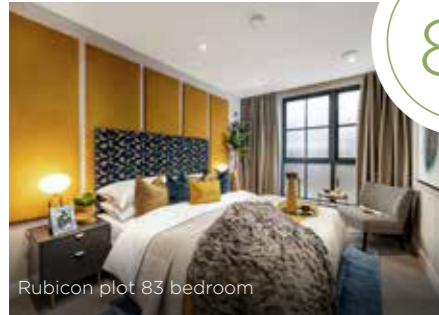
Rubicon plot 83 bedroom