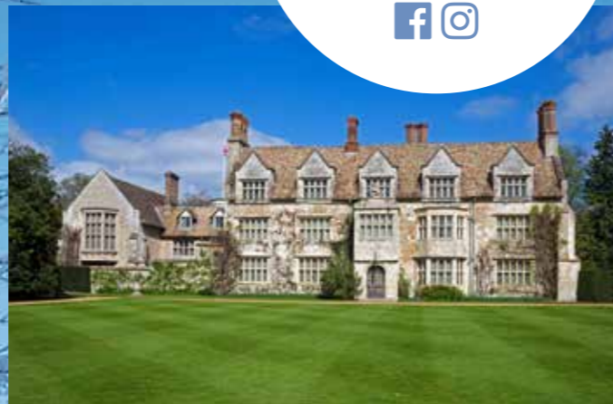
Winter Lights at Anglesey Abbey 9th - 21st December 2022

Anglesey Abbey, Quy Road, Lode, Cambridge CB25 9EJ