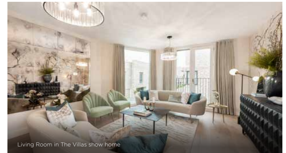
Living Room in The Villas show home

The end result is that you can enjoy a beautifully designed modern home that is environmentally responsible, without compromising on comfort or style.