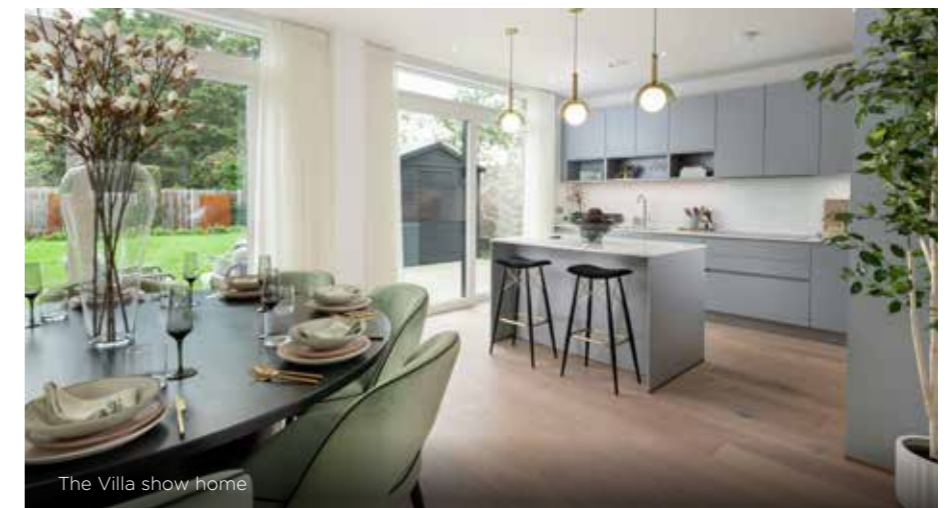
The Villa show home