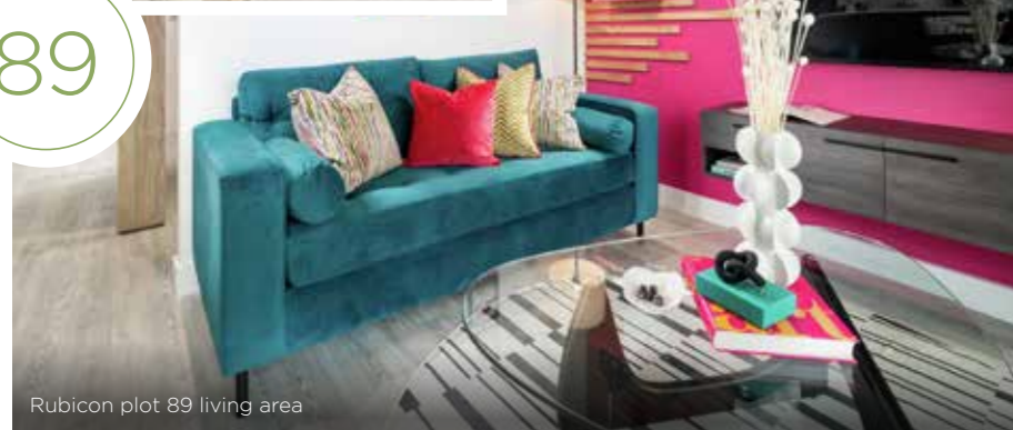
Rubicon plot 89 living area

Plot 89 showcases our stylish studio apartment. You may be surprised by the smart layout, which creates space to entertain or relax. The large bedroom area is cleverly separated from the living space, creating a private sanctuary while maintaining the flow of its flexible layout.