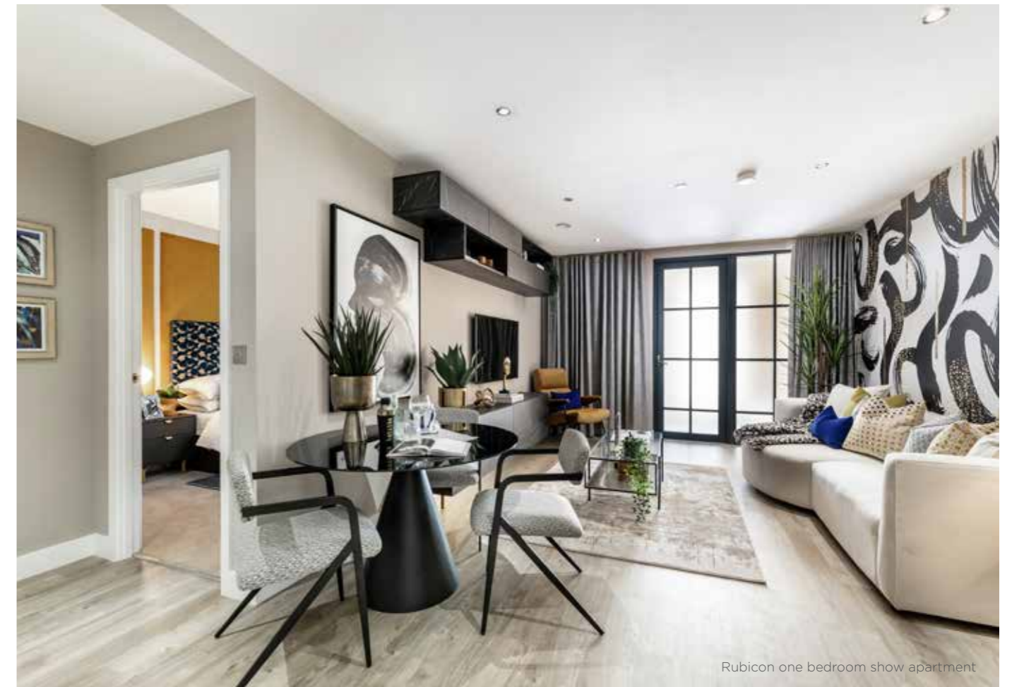
Rubicon one bedroom show apartment