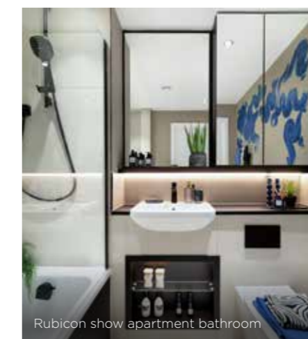
Rubicon show apartment bathroom

Inside, the apartments have their own sophisticated look, with black industrial-style glazing, contemporary kitchens with quartz worktops, and matt black sanitaryware. Full height windows, high ceilings and open plan layouts add to the sense of space and airiness, while underfloor heating brings warmth and comfort. Natural materials and a cool colour palette make the most of the abundant light and enhance the modern aesthetic.