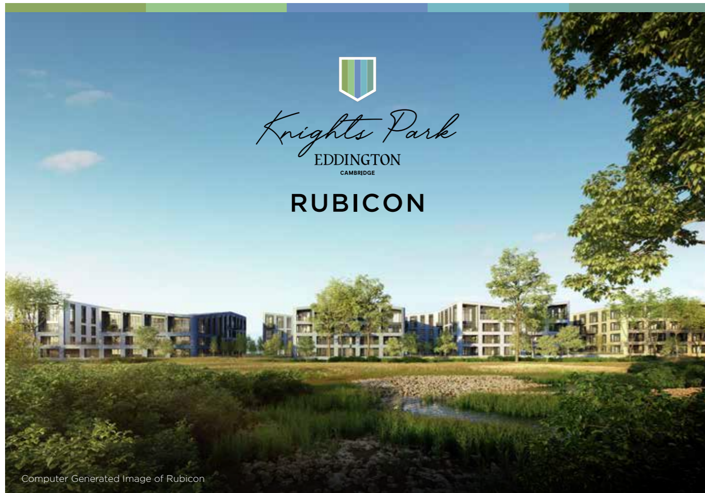
Computer Generated Image of Rubicon