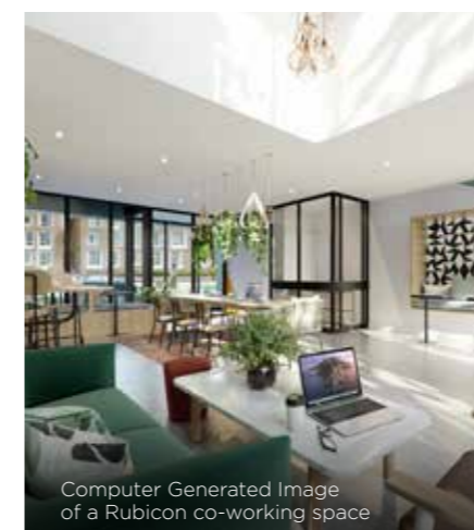
Computer Generated Image of a Rubicon co-working space

One of the most remarkable aspects of Rubicon are its co-working spaces. Thoughtfully designed, with contemporary and functional furniture, lush planting and atmospheric lighting, they are comfortable to work in, and offer sociability and stimulation when you want them. With a mix of private rooms and open areas, they are ideal for when you want to work remotely, if you're running your own business, or looking for collaboration or networking opportunities.