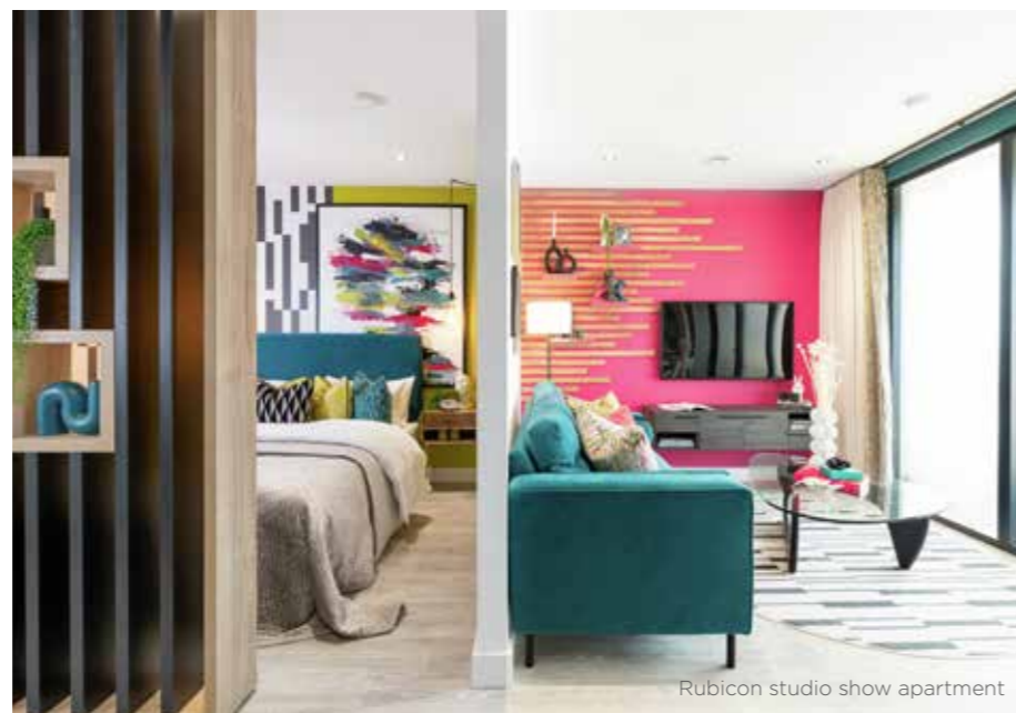
Rubicon studio show apartment

With its sloped roofs, shimmering bricks of different hues and beautiful landscaping, Rubicon both catches the eye and complements its surroundings. Designed by award-winning Alison Brooks Architects, it contains an exceptional range of apartments and penthouses, from studio to three bedroom duplex apartments.